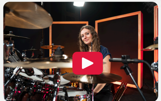
Learn a Polyrhythm as Fast as Possible