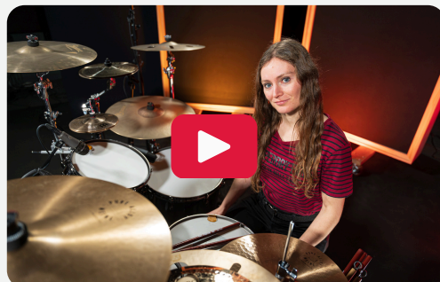
Metric Loop Performance