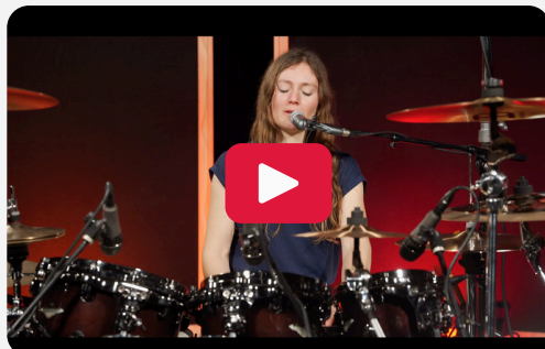
Singing & Drumming Masterclass