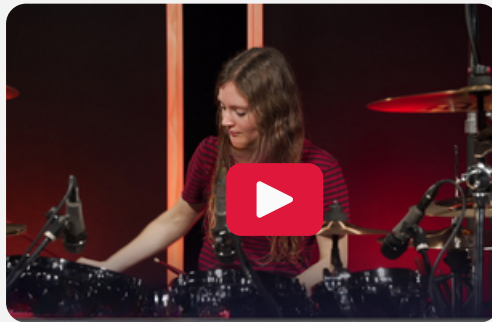
Mental Web Performance