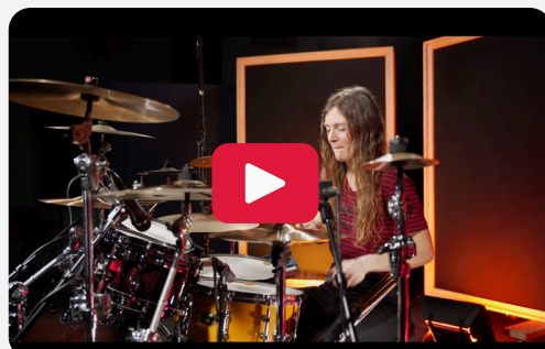
Mental Web Breakdown & Discussion