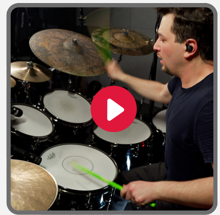
Performance: "Sense of Home"