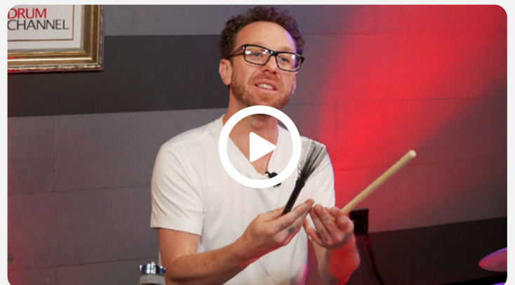
MIXING STICKS & BRUSHES