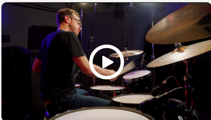
DOUBLE BEAT EXERCISE