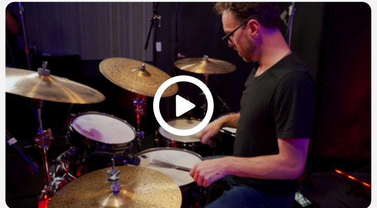
BUILD YOUR HAND TECHNIQUE USING BRUSHES