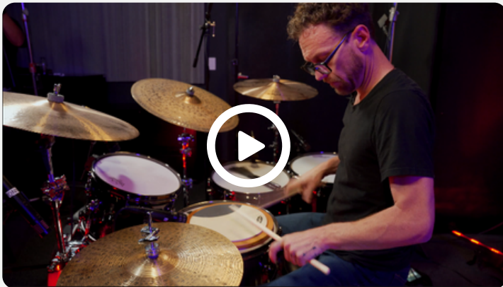
USING THE THUMB PIT

Creativity: Learn how to play inverted doubles for more musicality, along with what Scott calls “Squishin and Squashin the Padada.”