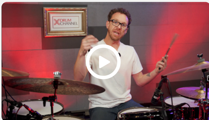
BRUSHES FOR HAND TECHNIQUE & CREATIVITY