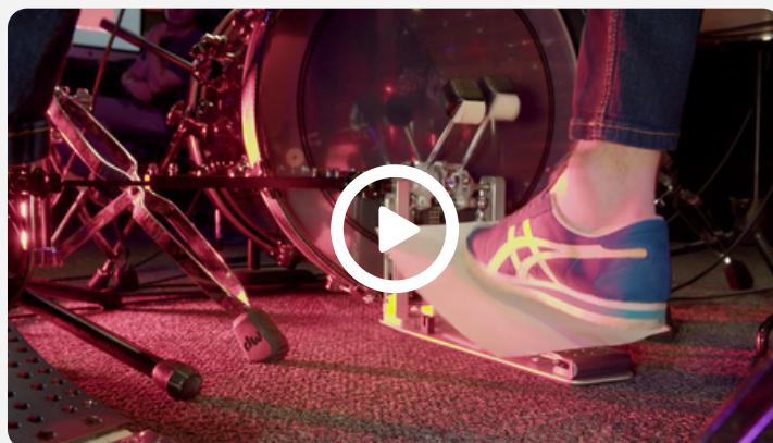
BASS DRUM TECHNIQUE LIFE HACKS