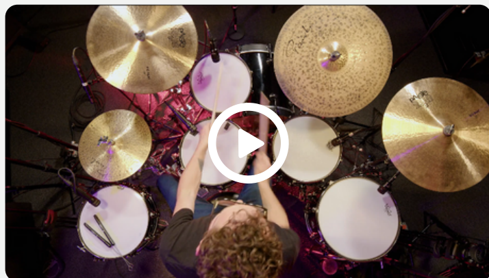
SQUISHIN' AND SQUASHIN' THE PADADA