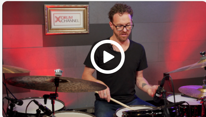
INVERTED DOUBLES FOR MUSICALITY