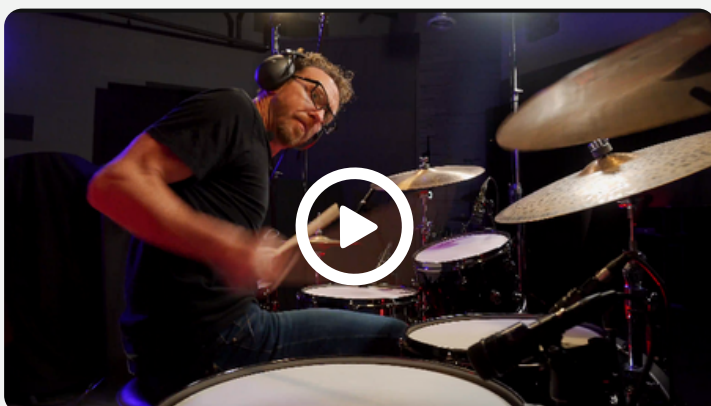
HAND/FOOT COMBINATION WARM-UP