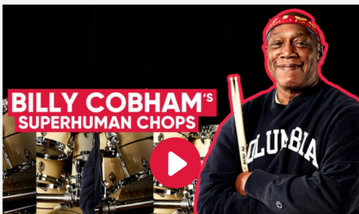
WHERE DID BILLY COBHAM GET HIS SUPERHUMAN CHOPS?