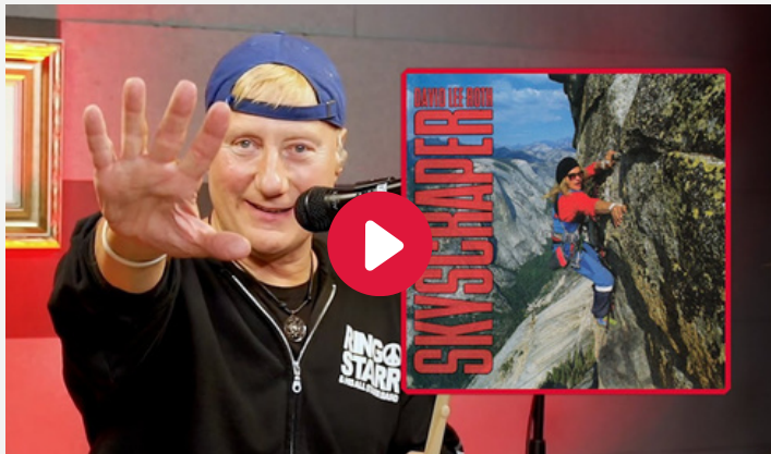
GREGG BISSONETTE'S STORY BEHIND DAVID LEE ROTH & STEVE VAI'S 'SKYSCRAPER'